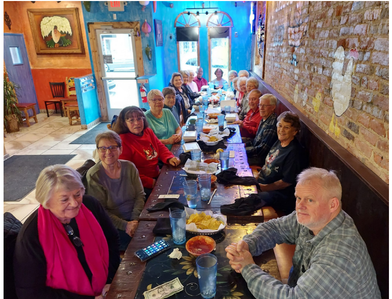
What a good-looking group! Enjoying time together at Mi Casa.

Although many of us are widowed, we are not exclusive and enjoy the company of others! (Updates are also available on Facebook at Area Widow(er)s Network.)