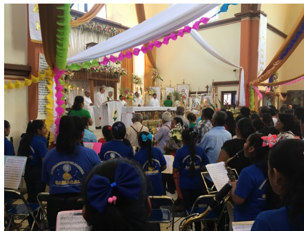
The children seated during the Feast of the Presentation of the Lord Mass.