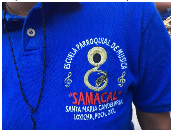
The School of Parochial Music "SAMACAL"

With handwritten music and borrowed instruments, the children performed with a true sense of accomplishment.