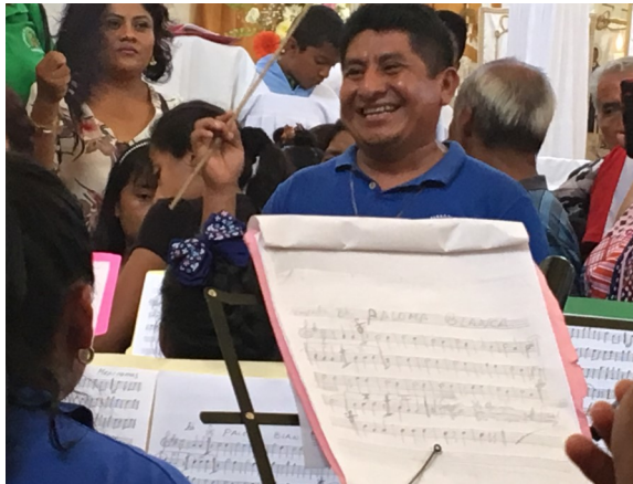
The music teacher never stopped smiling!